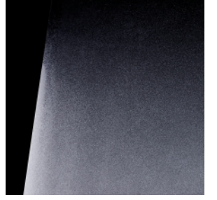
Mist - W : Single gradation Mist - S : Single gradation Mist - PR : Single gradation

Our popular Gradation Series works harmoniously with its setting to maximize available light. A space where light is not only welcomed by the use of FASARA<sup>TM</sup> Glass Finishes, but encouraged, it delivers a true holistic harmony with nature. Ensuring privacy is kept without creating a sense of closure. With a variety of configurations to capture your privacy and design needs, the new range of patterns deliver simple elegance while enhancing space and natural light into your built environment.