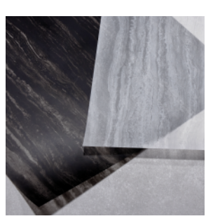
Travertine - White Travertine - Black